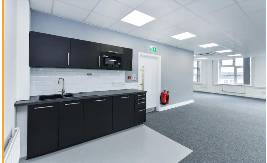
Second floor office suite to be refurbished as shown