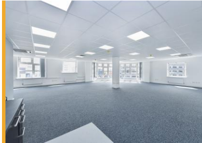
Second floor office suite to be refurbished as shown