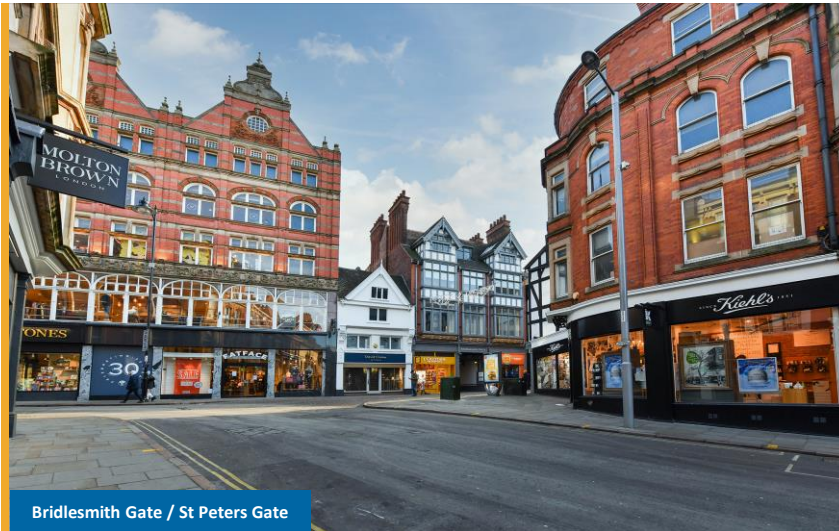
Bridlesmith Gate / St Peters Gate