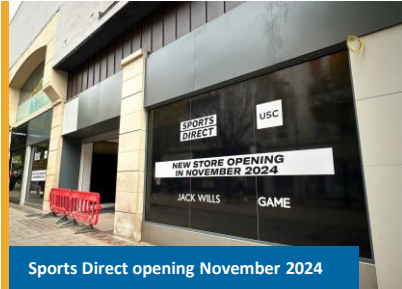
Sports Direct opening November 2024